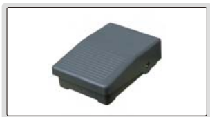
wireless footswitch (optional)